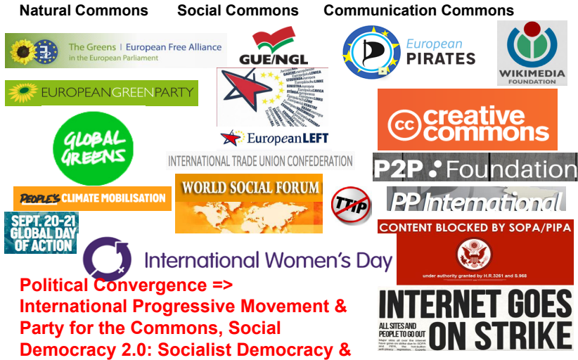
Figure 4: Political convergence of movements for the commons.

In respect of communications, the perspective of the commons-based society stands for the advancement of the digital commons, platform cooperatives, and a public-service Internet. Democratic communications shape and are shaped by ‘an association of free men, working with the means of production held in common, and expending their many different forms of labour-power in full self-awareness as one single social labour force’ (Marx 1867, 171).