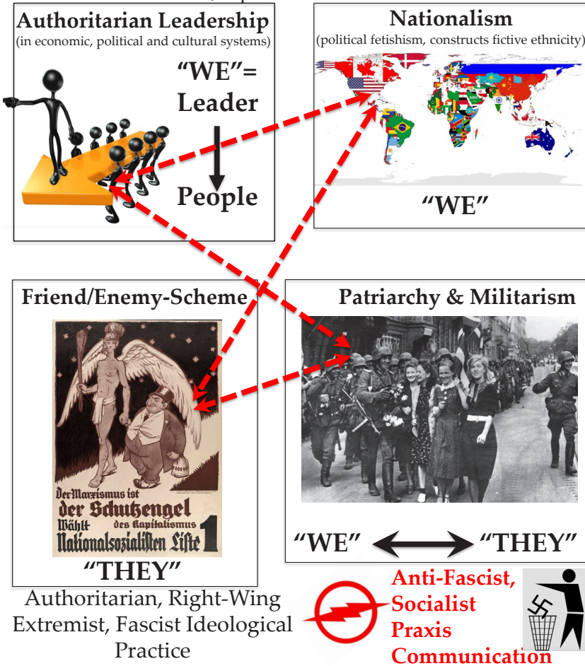
Figure 2: A model of right-wing authoritarianism.

RWA's social role: Deflection of attention from structures of class, capitalism and domination