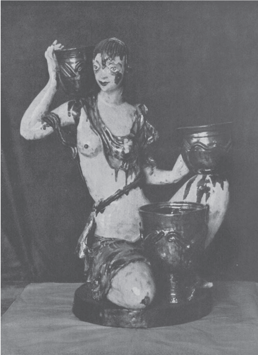
Figure 7.3. Vally Wieselthier, Sitting Figure with Flower Pots , 1928, red earthenware, white slip, blue, green, and orange glaze. H: 33" (84 cm), L: 27.2", W: 69 cm. Private collection.