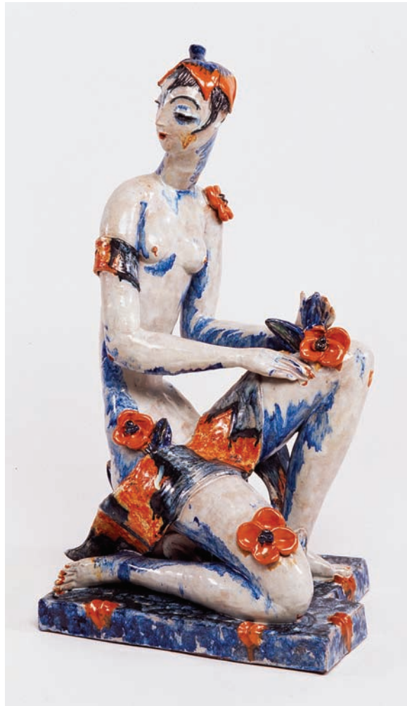
Figure 7.4. Vally Wieselthier, Flora , 1928, red earthenware, white slip, colored glazes. H: 24 \frac{3}{8} " (62 cm).

that the older, more experienced Jolanth was assumed to hold power over Elisabeth). The distinct stylistic similarities between the work of Wieselthier and female pupils like Baudisch and Rix are uncontested in the Werkstätte 's later period, as seen in the Frauenköpfe (Figs. 7.1 and 7.2). Debuting at Wieselthier's first solo exhibition in America, held at the New York Art Center from 9 November to 30 November 1928, were works like Flora (Fig. 7.4), animated by a transparent artificiality and expressive distortions that troubled notions of natural feminine beauty. Once again invoking the masklike artifice of face