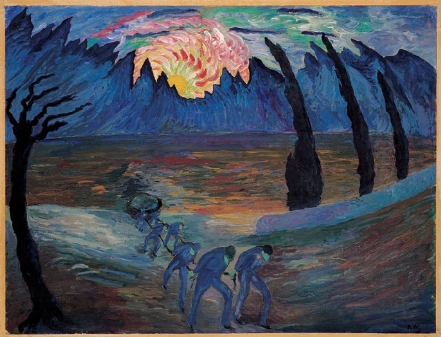
Figure 5.1. Marianne von Werefkin, Sonnenaufgang (Sunrise) , n.d., tempera on paper on cardboard. Fondazione Marianne Werefkin, Museo Comunale d'Arte Moderna di Ascona.

toward the viewer. The horizon line curls upward and inward, the trees bend impossibly, and the mountaintops curve like the rim of a bowl; the overall composition twists and turns, directing the viewer's eye upward to the kaleidoscopic sun, with rays of light bursting outward like the petals of a blooming flower. Yet the men face downward and away, oblivious to the radiant beauty just behind them. Although all of the men are painted in a nearly identical fashion, in blues and purples like the landscape surrounding them, there is an overwhelming sense of isolation. With no distinguishing features or faces, this is an image of mankind, laboring together, yet ultimately alone.