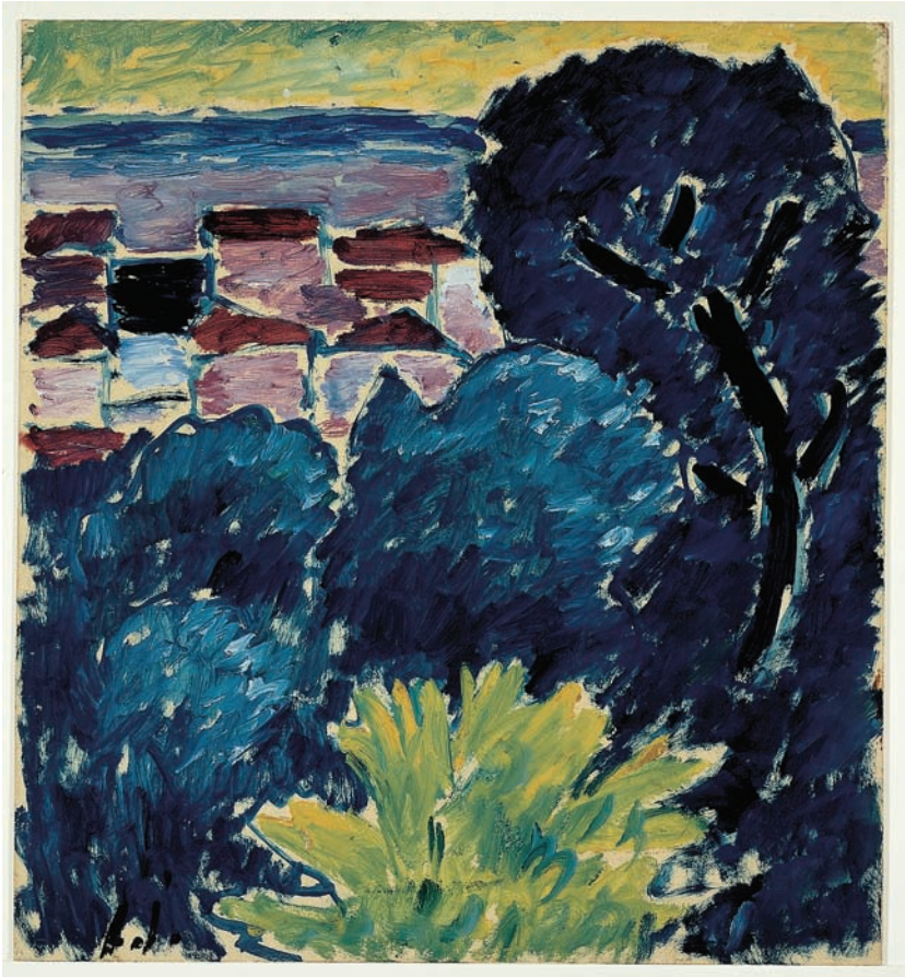
Figure 5.3. Alexej Jawlensky, Black Tree—Bordighera , 1914. Norton Simon Museum, The Blue Four Galka Scheyer Collection.

as a powerful force to abolish decaying conventions, the merits of Münter's oeuvre were grossly underestimated. 19 Indeed, it is my contention that Münter was neither seeking to emulate her male counterparts' methods, nor to present a self-abasing simplicity of style. Rather, Münter's artwork was an exploration, deeply personal and ever-changing, of her potential as an artist and her ability to distill and depict the essential nature of her experiences. Her dominant subjects were still-life arrangements of domestic objects, views of the rural Bavarian countryside, as well as portraits of her close companions. This selection reveals an artist whose concern lies in immediate