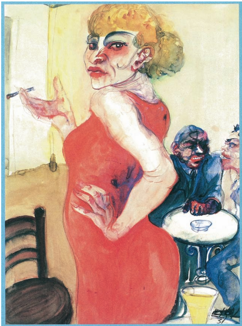
Figure 13.4. Elfriede Lohse-Wächtler, Lissy , 1931, watercolor over pencil. 49 × 68 cm. Private collection, courtesy Städel Museum, Frankfurt am Main.