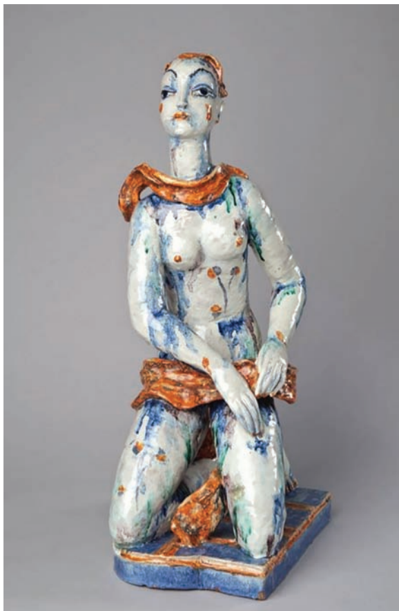
Figure 7.5. Gudrun Baudisch, Kneeling Girl , 1927–29, red earthenware, white slip, colored glazes. H 26.1" (66.2 cm), L: 12.6" (32 cm), W: 8.7" (22 cm).

painting and the “makeup” of female sexuality, Wieselthier has left patches of the raw earthenware visible beneath the white clay slip and spontaneously applied, free-flowing blue and orange overglazes. As Hörmann has observed, the proportions of Flora ’s limbs are strongly evocative of the expressive distortions of Wilhelm Lehmbruck’s female figures (296). Hörmann has furthermore assumed that the stylistic and formal influences between Wieselthier and Baudisch proceeded much like the relationship between Elisabeth and Jolanth in The Emperor’s Tomb : from the older, more experienced artist (Wieselthier-Jolanth) to the younger, more impressionable protégé (Baudisch-Elisabeth). Baudisch’s only known/extant example of large-scale earthenware sculpture, Kneeling Girl (Fig. 7.5, 1927–29), would not seem to disprove such a line of reasoning. Decorated in the orange-and-blue palette both artists favored, Bau-