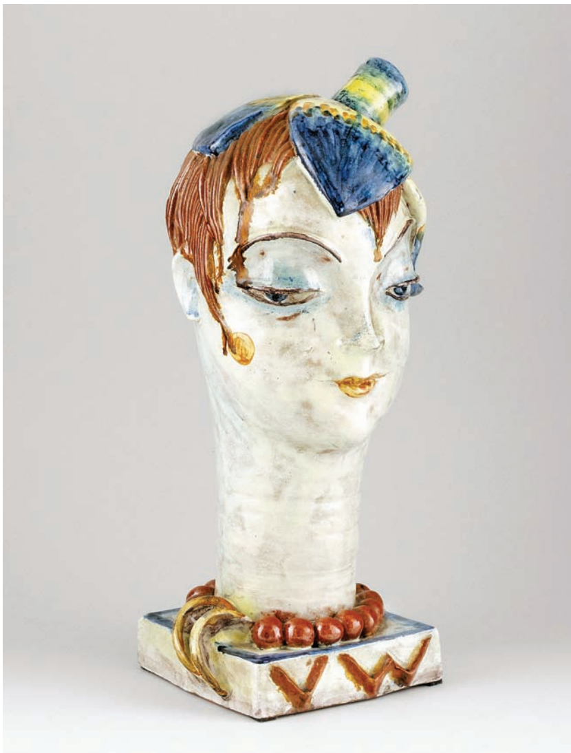
Figure 7.1. Vally Wieselthier, Head with Flower , polychromed glazed red earthenware, 1928. H: 14.6" (37 cm), L: 7.5" (19 cm), B: 7.1" (18 cm).