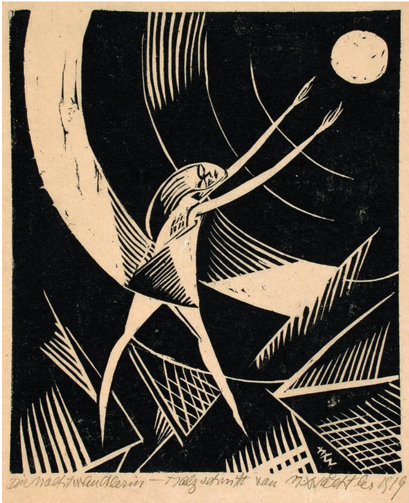
Figure 13.3. Elfriede Lohse-Wächtler, Die Nachtwandlerin (The Sleepwalker) , 1919, woodcut on brownish simili-japan paper. 26.7 x 22.7 cm. The Robert Gore Rifkind Center for German Expressionist Studies, LACMA, Los Angeles.