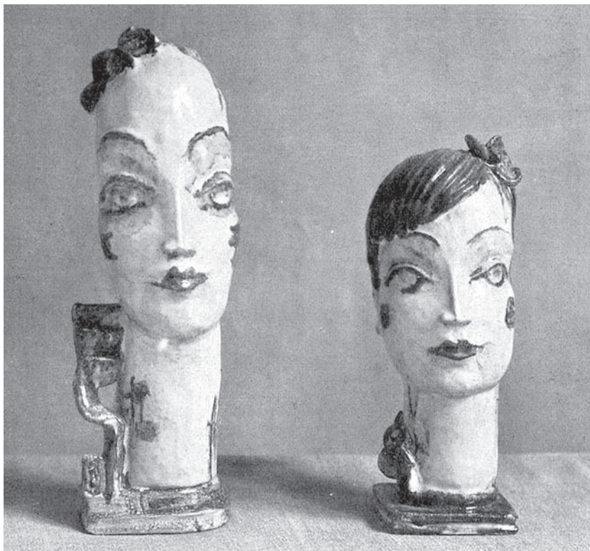
Figure 7.2. Gudrun Baudisch, Heads , earthenware, ca. 1929. Dimensions unknown.

origins at the potter's wheel, Wieselthier's vessel-based technique humorously played on the convention of equating components of thrown pots with parts of the female body (proceeding, from top to bottom, from "neck" to "foot"); yet the Frauenkopf's "neck" is in the wrong place, as if standing on its head, suggesting all the more potently the transgression of a pot that was not domestic, a domestic pot masquerading as a glamorous woman. Numerous examples by colleagues like Kuhn, Schmidl, and Singer, sometimes designed and executed in multiples, attest to a collective emphasis on cosmetic artificiality, interrogating how "putting on a face" had become a sign of normative female identity and sexual liberation. Not unlike Wieselthier, Kuhn and Schmidl often left patches of the unpainted red earthenware visible beneath the porcelain-complexion slip and, in the case of several Kuhn Frauenköpfe now located in