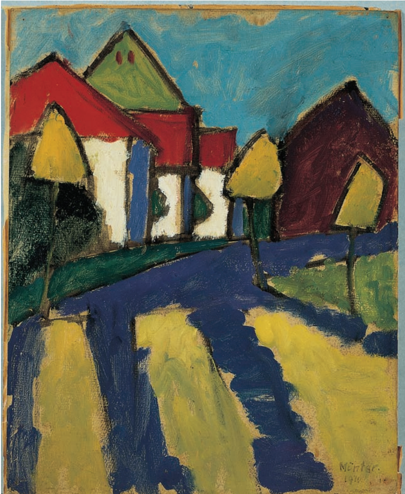
Figure 5.2. Gabriele Münter, Lower Main Street, Murnau, 1910 . Norton Simon Museum, Gift of Mr. David Gensberg.

executed as a rapid sketch, with the artist not bothering to conceal the steps of its creation. Although very lightly applied, the brushstrokes are visible, revealing the motions of the artist's hand. Significantly, the quality of brushstroke is distinct between the black outlines and the fills of color. Whereas the outlines are applied almost exclusively as rigid horizontal, vertical, or diagonal lines, the flat expanses of color show a looser, flowing motion of the brush. Even