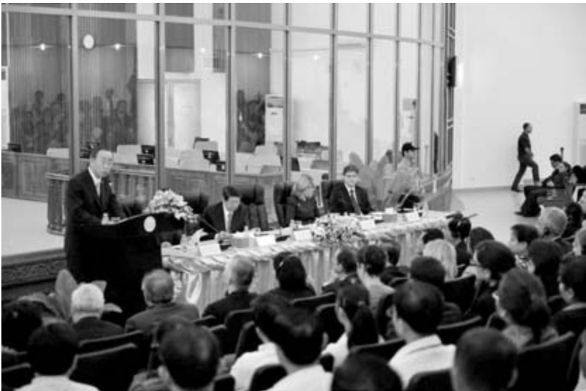
UN Secretary-General Ban Ki-moon ( left ) addresses the ECCC judges and staff in the courtroom gallery during an October 2010 visit to the tribunal.