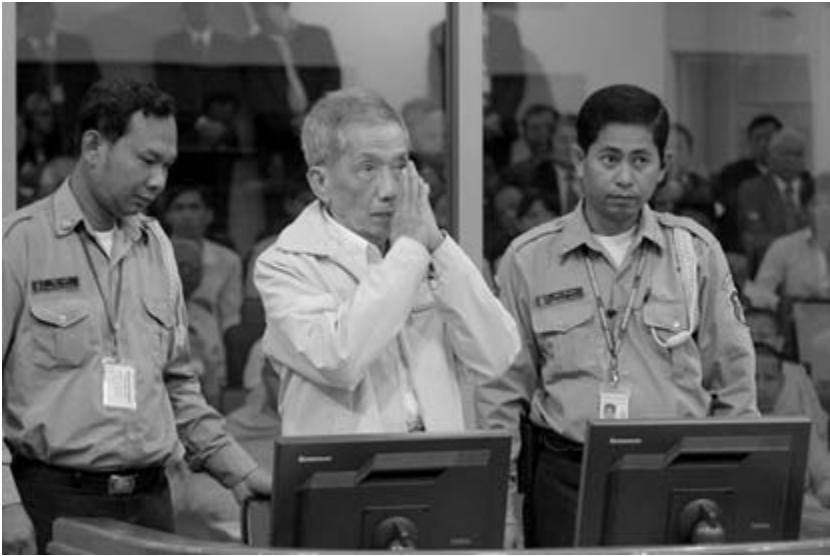
Duch on the day of the appeal judgment.