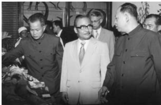
Khieu Samphan ( left ) and Ieng Sary ( right ) with Lao Prince Souphanouvong ( center ) during his visit to Democratic Kampuchea.