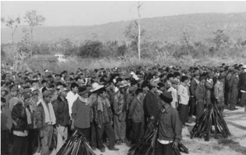
Khmer Rouge soldiers in the mountainous northwestern province of Anlong Veng turning over their weapons to defect to the government with Ieng Sary in 1996.