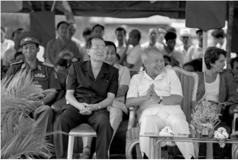
Head of the UN Transitional Authority in Cambodia Yasushi Akashi ( left ) and King Norodom Sihanouk ( right ) during the UN's interregnum in Cambodia in 1992–93.