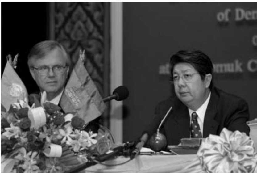
UN Legal Counsel Hans Corell and Cambodian Deputy Prime Minister Sok An return to the Chaktomuk Theatre for the signing ceremony of the ECCC's Framework Agreement, June 6, 2003.