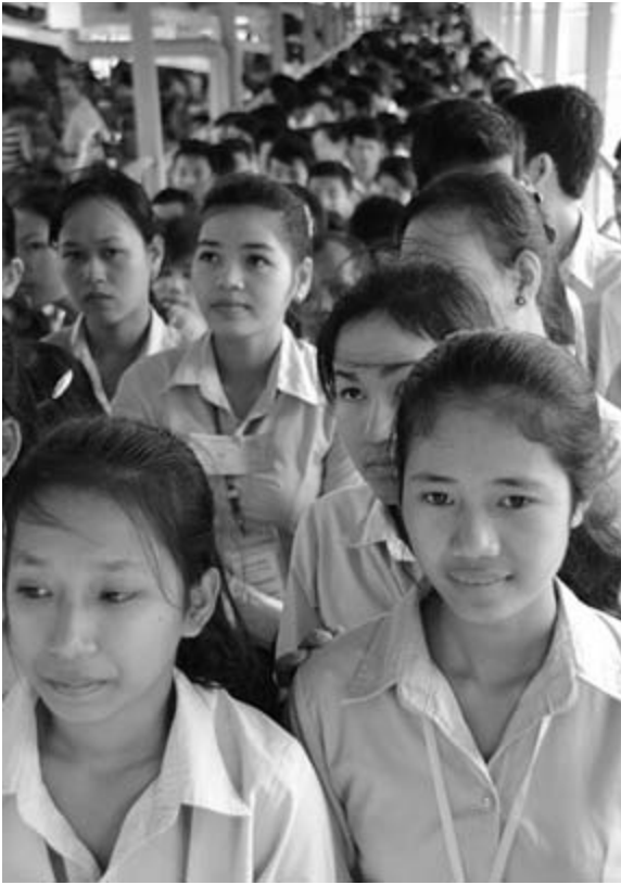
Public visitors to the ECCC on the third day of Case 002 opening statements, November 23, 2011.