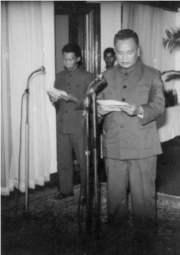
Nuon Chea, former Deputy Chairman of the Communist Party of Kampuchea, addressing Chinese visitors to Democratic Kampuchea ( top ) and addressing the ECCC Trial Chamber on December 14, 2011 ( bottom ).