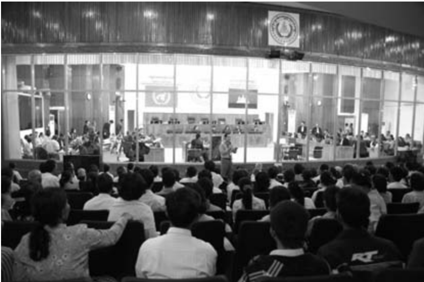
Visitors being briefed in the public courtroom gallery before a Case 002 trial hearing as prosecutors and civil parties ( left ) and defense teams ( right ) take their seats.