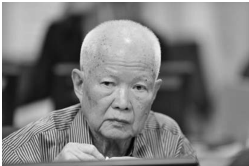
Khieu Samphan during the proceedings against him at the ECCC.