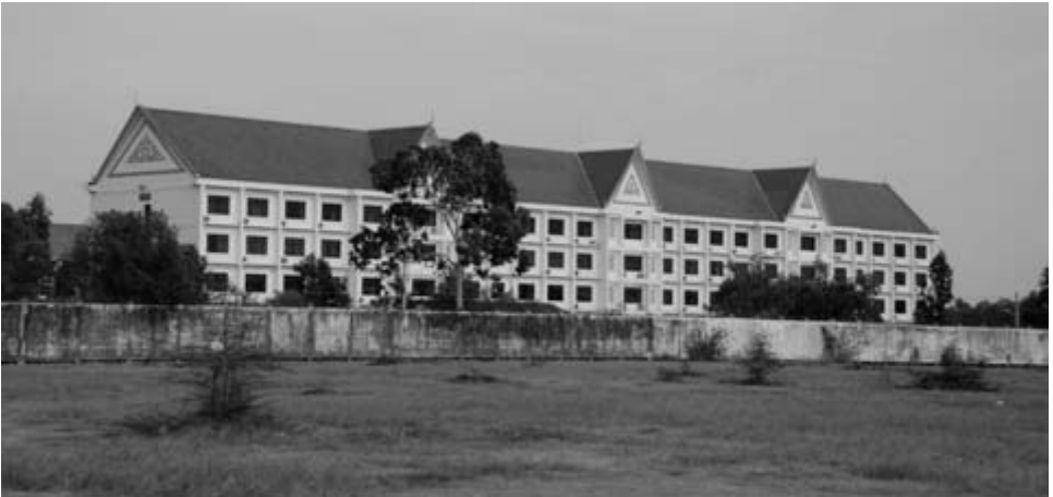
The ECCC complex, including the courtroom ( top ) and administration building ( bottom ) on the site of a former military base on the western outskirts of Phnom Penh.