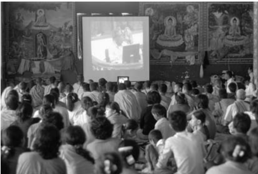
Villagers watching Duch's trial on screen at an outreach event in a pagoda at the former Khmer Rouge stronghold of Pailin in northwestern Cambodia.