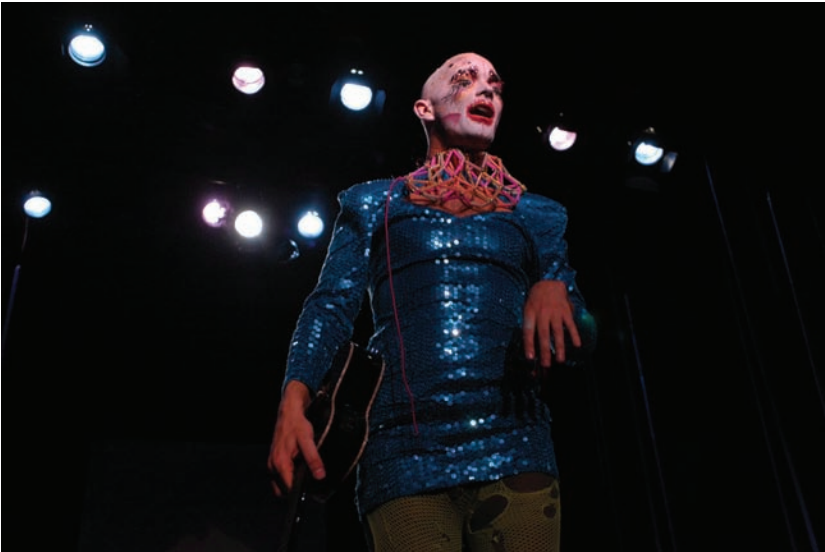
Figure 6: Taylor Mac in The Be(a)st of Taylor Mac (2008).

texts. It was the unique style of this Ridiculous aesthetic that inspired Mac to learn more about the playwrights and actors who originally introduced the genre. Mac generates his provocative approach to the Ridiculous genre by employing it as a tool for political satire and radical commentary. This chapter traces the queer genealogy between Ludlam and Mac as well as Mac's performative career through his development of a signature character, a "Pierrot figure for the modern age." 7 It attempts to unpack the tension between having one's own style while being part of a legacy, as well as the tension between the Ridiculous "style" and its political claims. Mac was initially drawn singularly to the aesthetic strategies and conventions of the Ludlamesque but extended his approach to the Ridiculous sensibility into a broader context that attempts to address all Americans in the paradigmatic search for national identity in the post-9/11 era.