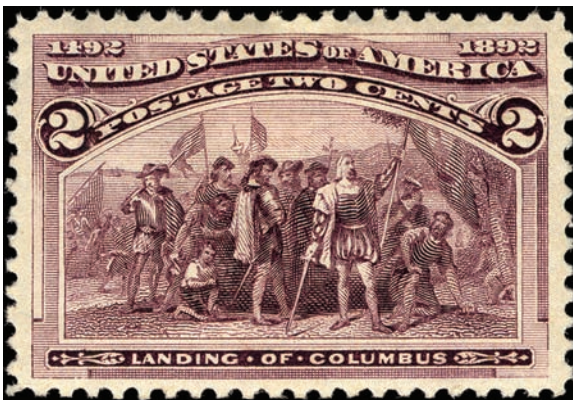
Fig. 8. Landing of Columbus, two cent, 1892–93

The two-cent stamp, the most widely disseminated of all in the series, also was based on a historical painting that maintained Columbus as a founding father. John Vanderlyn painted the Landing of Columbus , which hangs in the Capitol Rotunda. It represents Columbus's party landing, but unlike Powell's imagery, this one did not include any Native peoples. 19 Their presence is erased as if they did not exist