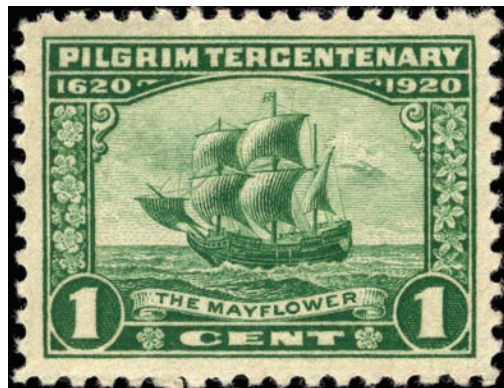
Fig. 12. Pilgrim Tercentenary, one cent, 1920

Mayflowers, fittingly, flanked each stamp's scene, and like the Columbians, the Pilgrim Tercentenary series formed a short narrative. The story began on the one-cent stamp with the Mayflower sailing west across the ocean on its journey with no land in sight—origin or destination (fig. 12). Similar to the Columbians, the landing occurs in the two-cent stamp—the most commonly used stamp to mail a letter and the standard rate of first-class postage until 1932. 15 This stamp's engraving makes the landing look harsh, unexpected, and jolting for the party at Plymouth Rock (see fig. 13). Men, women, and children huddle together, illustrating that family units migrated to the New England coast. Although this image suggests that struggles lie ahead for the settlers, the rock is what grounded the travelers, and is the object that grounded those celebrating the anniversary in the past. Plymouth was the ceremonial ground in 1920 and provided the physical connection to the past events.