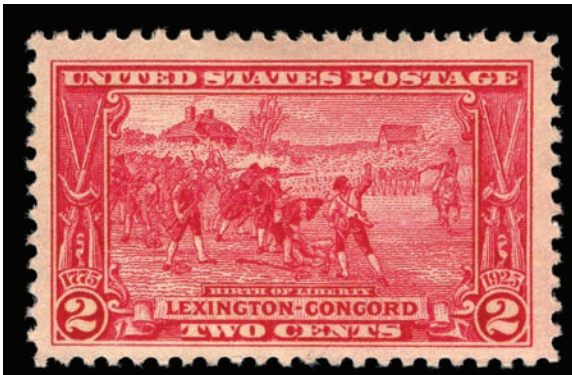
Fig. 21. Birth of Liberty, two cent, 1925

in the background. The viewer is led to believe that the Continental Army organized soon after the first confrontation and was prepared for combat.