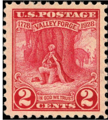
Fig. 23. Valley Forge issue, two cent, 1928

acts as a label interpreting the scene, telling consumers that this is why we trust in God, because Washington trusted in God and the United States reaped the blessings of independence. Any debates over Washington's religious beliefs or his aversion to prayer were settled in the minds of some Americans because the USPOD printed and circulated this interpretation of Washington's private life.