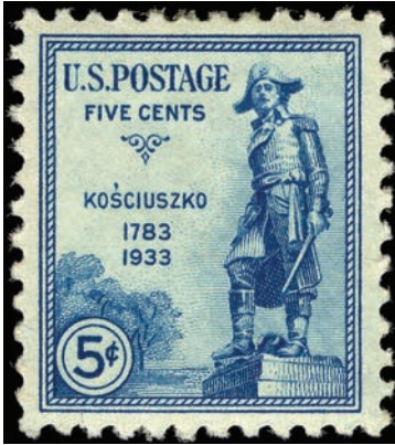
Fig. 25. Kosciuszko, five cent, 1933

European immigrants were defined as racially different from old stock immigrants hailing from western Europe. Celebrating Kosciuszko's naturalization tells us that it was important for the Polish National Alliance, Polish Roman Catholic Union, and other organizations to broadcast their hereditary claims to Revolutionary lineage and American citizenship. The first naturalization law in 1790 dictated that only a "free white person" was eligible for citizenship. Kosciuszko qualified as white and fit for citizenship, contradicting the justifications behind immigration restrictions of people from Poland found in the Quota Act and Johnson-Reed. In the early twentieth century, Polish Americans were inching their way out of an in-between status, racially, and used the accomplishments of two Polish military men who volunteered (and died, in Pulaski's case) for the American cause during Revolutionary War as their connection to the origins of the republic. 60