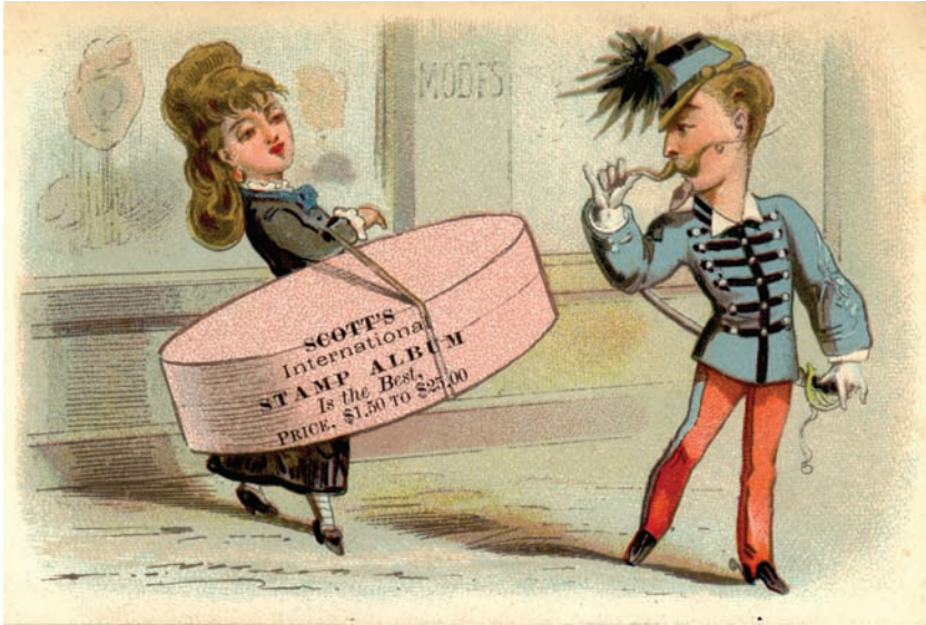
Fig. 6. Scott's International Stamp Album trade card, late nineteenth century

technology and customized cards branded with the company's name and products. These trade cards were a popular collectible in their own right because they came free in packaging and contained attractively colored images that belonged to sets, meant to be completed. Many children, particularly girls, collected and kept cards in scrapbooks, an activity that prepared girls especially to become keen and brand-conscious shoppers for their future households. 2 Trade cards that advertised stamp albums associated stamps and related materials as consumer products to male and female consumers.