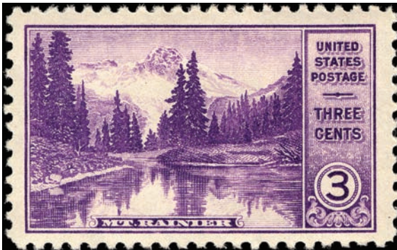
Fig. 30. National Parks Mt. Rainier, three cent