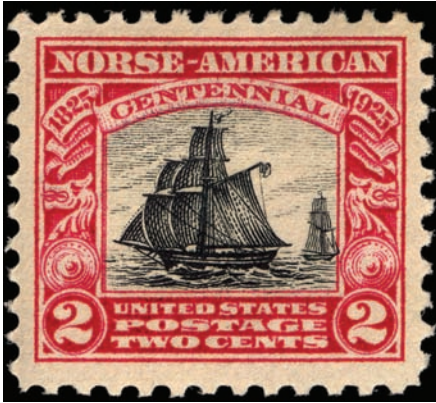
Fig. 18. Norse-American Centennial, two cent, 1925

The second stamp does not represent the landing, but the five-cent issue features an engraving of a Viking ship built for the Columbian Exposition. That ship sailed from Norway to Chicago to remind fairgoers and stamp consumers in the 1920s that Norwegian explorers visited America long before Columbus, the English-Dutch Pilgrims, the Huguenots, or the Walloons. This particular image, interestingly, pointed the ship's bow toward the east, or toward the homeland. On the stamp, the Viking ship sails from a banner or shield of Norway toward one of the United States, and the Norse-American Viking ship is flying colors similar to an American flag.