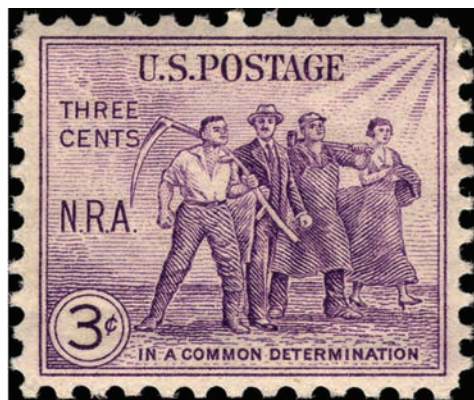
Fig. 26. National Recovery Act issue, 1933

Similarly, in the Century of Progress stamp that promoted the 1933 World's Fair in Chicago, Eilenberger saw the "fulfillment of sacrifices and struggles of the early pioneers," such as the sons of Washington's soldiers from Newburgh who migrated west and south "in search of better homes and greater opportunities for their children." Their "success" was aided with developments of science and technology, but it really was due to "self-reliance" and the "American spirit." 14 The NRA stamp, representing a voluntary collective effort to manage labor, wages, and pricing in a time of economic depression, was crafted as the logical next step in the progressive and triumphalist vision of American history that prized individualism and encouraged individuals to work together for a greater good. As support for the NRA's voluntary codes and wage equality waned in 1934, Eilenberger gave a political speech to philatelists using the language of stamp imagery to seek support for the New Deal program.