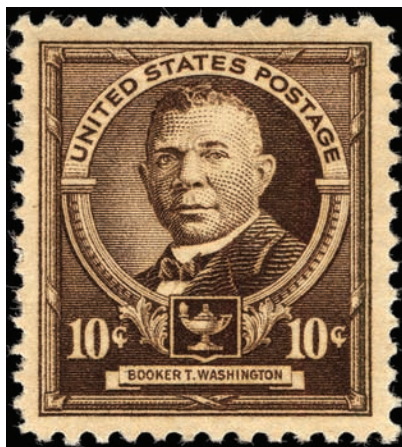
Fig. 33. Booker T. Washington ten cent, Famous American series, 1940

white—marched on stage in military costumes, carrying an American flag that they then draped across the shoulders of Major Wright “in token of his victory in securing” the Washington stamp. 40 The multiracial audience and participants appeared to “cast down” their buckets in a joint celebration of Washington’s work.