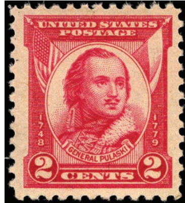
Fig. 24. General Pulaski, two cent, 1931

The final design represented Kosciuszko standing as a military officer, distinguishing his stamp from other Revolutionary War citizen-soldier stamps, and instead identified him as a leader.