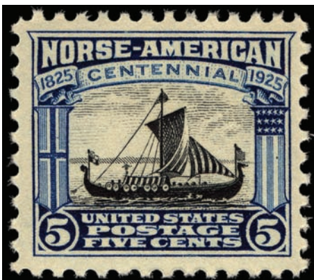
Fig. 19. Norse-American Centennial, five cent, 1925

These stamps were in high demand from collectors because of the design and intensity of the ink colors, and they sold out. The USPOD