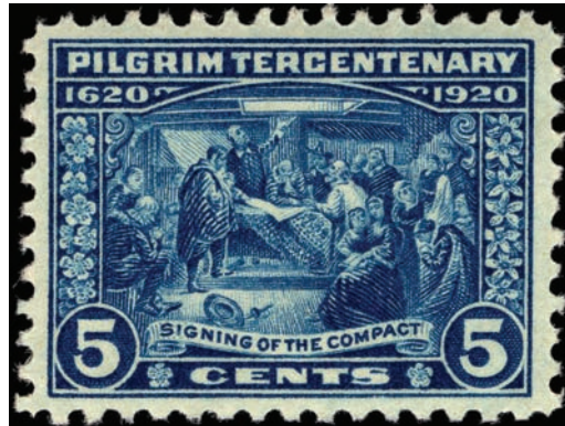
Fig. 14. Pilgrim Tercentenary, five cent, 1920

Historic Genealogical Society that there were “radical differences of character and influence” between Mayflower descendants and Jamestown settlers, because Plymouth “subordinated the commercial spirit (of Jamestown) to that of securing ecclesiastical and political freedom for themselves”—seen in the five-cent stamp. The William and Mary Quarterly responded that those charges were “so gross, so unprovoked, so untrue,” and the statement of such freedoms and strength of character in the north were exaggerated. 17