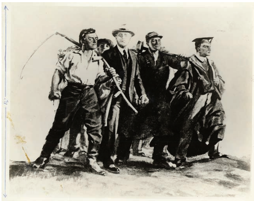
Fig. 27. Rejected design for the National Recovery Administration stamp

on a stamp, but we then can see that the businessman in the printed stamp who is pivotal in the recovery efforts is Roosevelt. The rejected design also represents academia, with a male graduate dressed in cap and gown, and a woman looks over the shoulders of the farmer and Roosevelt, relegated to the background of the image and not standing equally among the men. The final NRA stamp represented citizens as active in their own recovery.