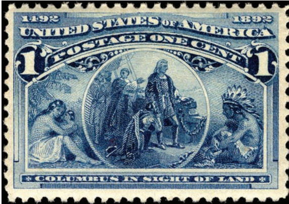
Fig. 7. Columbus in Sight of Land, one cent, 1892–93

bean native. These images visually foreshadowed and justified the conquest that followed Columbus's arrival. This stamp's representation of Native peoples was not dissimilar to how American Indians and other nonwhites were represented on the Midway Plaisance, as savages and ethnologically inferior to those with Anglo-Saxon blood roaming the fairgrounds. 18 Here, the stamp stages Columbus as the civilizer arriving in a savage land.