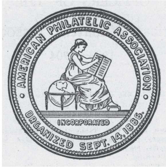
Fig. 1. Seal of the American Philatelic Association

tending to the stamps kept in her album. Her position suggests that she can control the world on which she sits, gesturing that collecting stamps is symbolically similar to the imperialistic logics that justify how one country believes others are available to be collected and controlled. She is focused on her stamp album, appearing studious and unaware of others, and is not welcoming or open as she faces away from observers. Her focus on the album and its stamps offers a model for all philatelists who described themselves as “prostrate admirers and worshippers” and “all in love with one female—the Goddess Philatelia.” 28