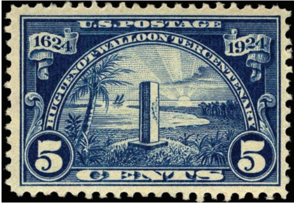
Fig. 17. Huguenot-Walloon Tercentenary, five cent, 1924

unnamed monument facing a rising sun in what appears to be a tropical climate. Palm trees and plants surrounding the structure contrast with the rocky, sparsely planted landscape pictured in the two-cent settlement stamp. The five-cent issue actually represents a stone monument erected by Jean Ribault, who explored the area near Mayport, Florida, in the 1560s to establish a refuge colony for French Huguenots. Before returning to France to pick up passengers for the sail back to Florida, Ribault erected a stone column festooned with the French king's coat of arms to claim Florida in the name of France. As part of the Huguenot-Walloon anniversary in 1924, the Florida chapters of the Daughters of the American Revolution financed the construction of a similarly shaped monument to honor Ribault and the "first landing of Protestants on American soil." 21 Interestingly, the memorial to the Walloons erected in Manhattan's Battery Park during the 1924 tercentennial does not mention their religion or status as persecuted religious refugees.