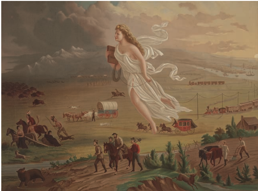
Fig. 3. "American Progress," chromolithograph, published by George Coffut, 1872

The APA's image represents a striking similarity to late nineteenth-century art representing American destiny and progress, as the APA envisioned itself as a leader in the philatelic world. The Philatelist's Dream is reminiscent of the 1872 painting American Progress by John Gast, which was distributed widely and sold in lithograph form.