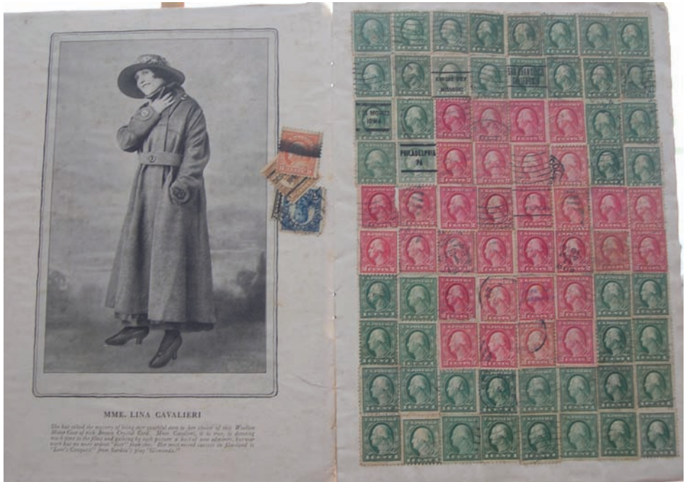
Fig. 5. Page from homemade stamp album, ca. 1917 (album courtesy of Cheryl Ganz)

Gathering evidence of different ways that people collected and illustrated their own narratives through their stamps proves difficult because philatelic standards do not recognize collecting conventions falling outside of standard album keeping. Handmade albums or decorative stamp pieces are often discarded because the philatelic community places little or no value on them. For example, the album pictured in figure 5 is worthless in the eyes of auctioneers today. Someone made this album using a local department store catalog and reinforced it with cardboard. The collector gummed—without the hinges typically used with a philatelic album—inexpensive stamps and stamp-shaped stickers to each page in colorful patterns over the illustrations of women modeling the new winter line of coats. Created during World War I, the album displays a red cross in stamps that may have been a way that this person remembered those wounded in war. Stamp papers discouraged this type of decoration with stamps and particularly discouraged gumming stamps directly to paper. 67 This collection fell outside of phil-