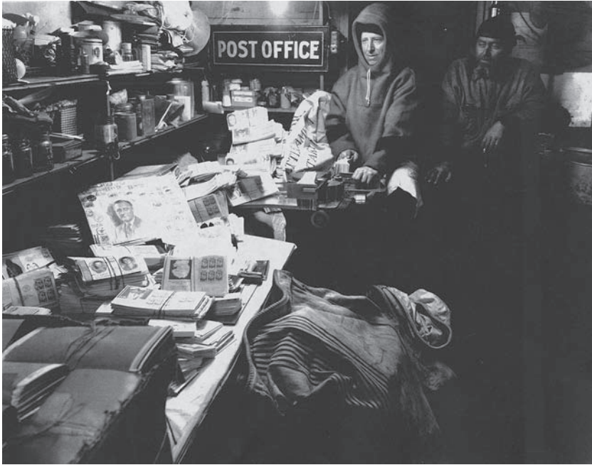
Fig. 29. Little America post office overrun with covers awaiting cancellation