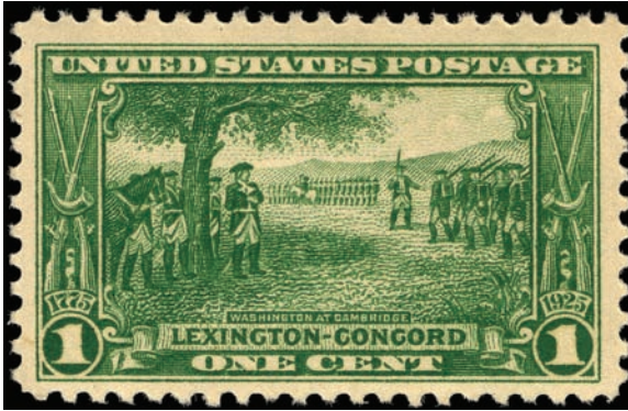
Fig. 20. Washington at Cambridge, one cent, 1925