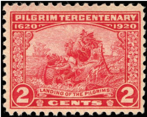
Fig. 13. Pilgrim Tercentenary, two cent, 1920

The journey's symbolic end revealed itself in the five-cent (see fig. 14), where the Mayflower Compact was signed, indicating permanence, and showed the first document of self-governance in what would become the United States. Copies of the Compact were printed and distributed for the Tercentenary. Divine right blessed this settlement as the central figure points toward the light illuminating the signing. Drawn from a painting by Edwin White, the signing image illustrates families migrating together, even though only men signed the document. 16 The scene emphasizes that there was a community, comprising family units, who crafted the Mayflower Compact and pledged to work together. At the time of the anniversary, New England preservationists and genealogists argued that the Plymouth Pilgrims were the true first Americans because family units arrived together to form a permanent settlement through signing the Compact, unlike the commercially minded individuals who sailed to Jamestown. By representing this scene, the Tercentennial committee reiterated their argument and wanted all Americans to consider Plymouth as the birthplace of the America.