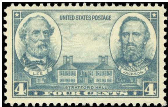
Fig. 31. Lee-Jackson, four cent, Army-Navy series, 1936

more for American Democracy than Gen. Lee or Stonew(a)ll Jackson.” 28 The USPOD stood squarely amid a cultural debate over political equality and the legacy of the Civil War in the 1930s. Commemoratives representing Confederate officers acted as another attempt by the FDR administration to use stamps to promote nationalism, but these stamps were read as a clear rejection of political equality promised at the end of the Civil War. By appearing on US stamps, Lee and Jackson were not traitors, but American war heroes who looked out from postage alongside the portraits of George Washington, William Sherman, and Ulysses S. Grant.