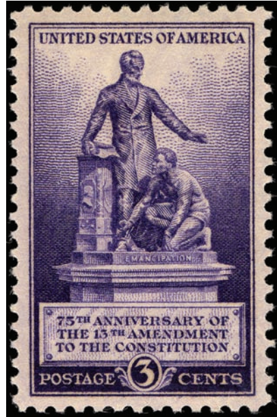
Fig. 34. Thirteenth Amendment, three cent, 1940

of bondage. Although the sculpture was financed partially by formerly enslaved people, a white commission controlled the sculpture's construction and chose a design representing emancipation as a generous act of moral leadership by Lincoln and enfranchised whites. Supposedly honoring freedom from bondage, the sculpture as composed by artist Thomas Ball did not represent a newly freed male figure on equal ground with Lincoln. The enslaved figure was still breaking away from slavery, with no symbols of hope designed into the memorial to indicate that freedmen could ascend to a position of equality promised by emancipation. Given to the city of Washington in 1876 by the "colored citizens of the United States," the memorial reasserted racial hierarchy in which descendants of enslaved people would always be inferior to white men. 46 In choosing this image to commemorate emancipation with the Freedmen's Memorial, the USPOD celebrated Lincoln, not freedom and equality, but instead a racial order in which descendants of enslaved people could never realize full equality in the United States.