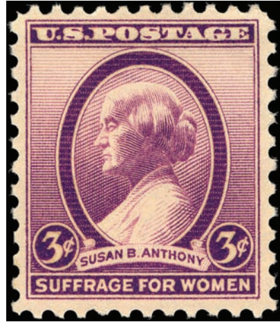
Fig. 32. Susan B. Anthony, three cent, 1936

in the army-navy series coincided with further indecision by Farley about an Anthony stamp. The Anthony Memorial Committee believed Farley kept “giving the women the run-around” by misleading them as to when the USPOD might issue an Anthony stamp: “First, we are too early, now we are too late.” The timing was never right, and seemed like an impossible battle to win. 29