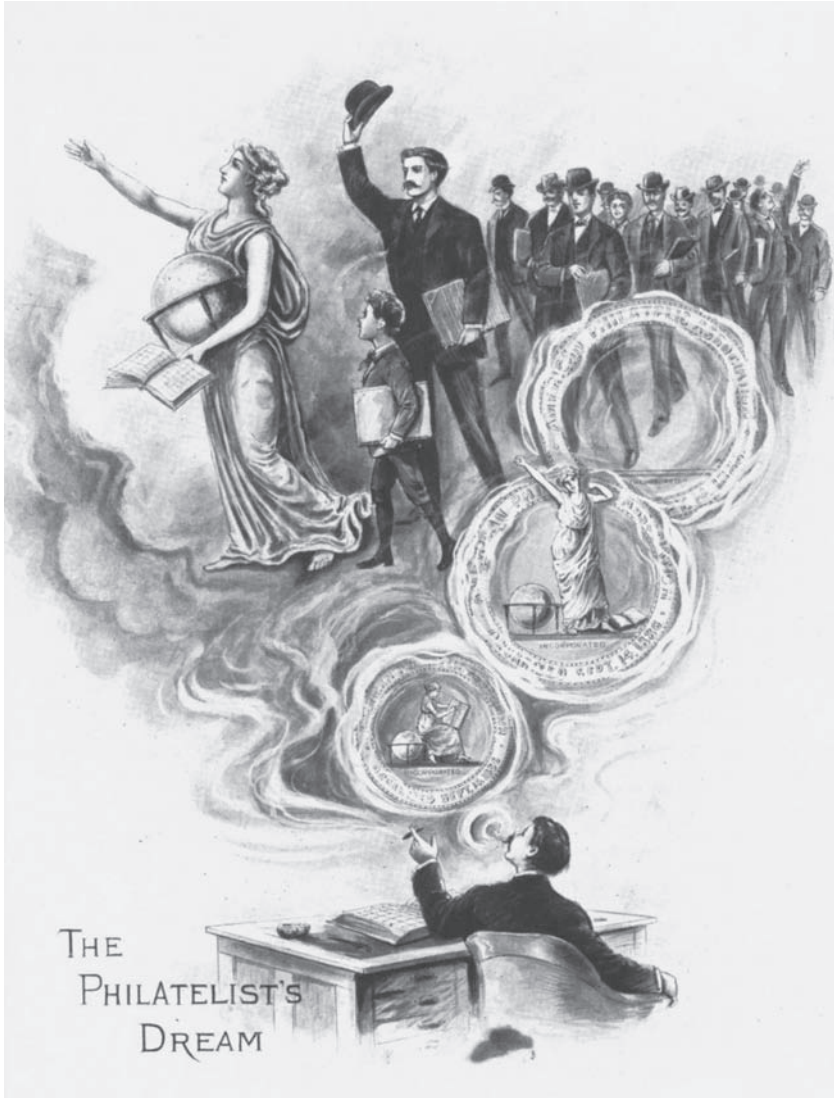
Fig. 2. "The Philatelist's Dream," illustration