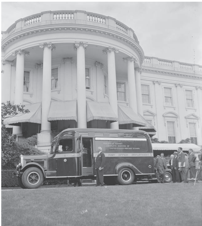
Fig. 35. Philatelic truck at White House, May 9, 1939

the early twentieth century. While bookmobiles served statewide or regional populations, the philatelic truck's audience was national. 50 With assistance from the Bureau of Engraving and Printing, the Philatelic Agency designed exhibit cases to fit inside of a panel truck that traveled 20,750 miles, visiting 490 towns and cities. The truck carried displays of US definitive, airmail, and commemorative stamps; postcards and envelopes; and a miniature printing press that stamped out souvenirs while demonstrating the printing processes. 51