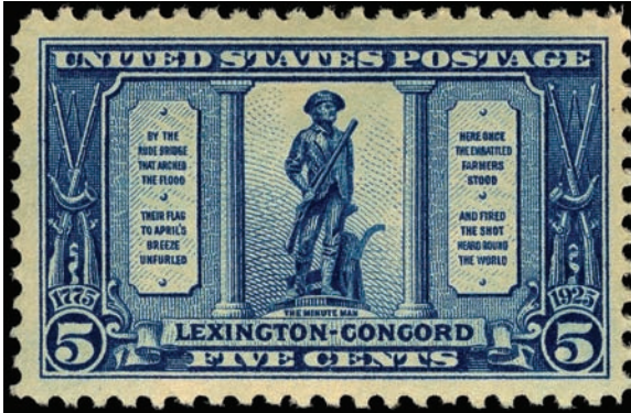
Fig. 22. The Minute Man, five cent, 1925

veterans. In the case of the Minute Man , though the physical statue stood in Massachusetts, once on a stamp its representation became a national symbol of the earliest citizen soldiers who fought for independence. It was the stories of these men “who helped free our great and mighty country” represented on postage that collectors like Thomas Killride spoke of in his poem “My Stamps.” 38 Civil War monuments acted in ways to unify the country by focusing on the individuals who fought rather than the reasons for fighting. During the Revolutionary War, northern and southern colonies fought together, even if it was for a loosely knit union. In 1925, the Massachusetts Minuteman acted as a unifying figure for celebrating white male citizenship throughout the United States.