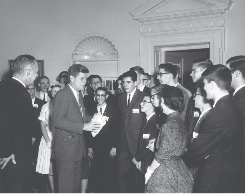
Figure 1. In the Oval Office, March 6, 1961

As I read now what I wrote at seventeen years old, I am struck by how much it foretold. I did indeed move from math in college to what I considered to be the vital field of political science in graduate school. Later I applied my math to evolutionary biology. I also became fascinated by artificial intelligence for games of strategy, and then conducted my own computer tournaments. I fulfilled my hope of working in interdisciplinary groups, one of which included people from five or more disciplines and stayed active for more than twenty-five years. I also did research in psychology, including the coherence of belief systems and the basis for ethnocentrism. As for physiology, I had an idea about cooperation among tumor cells that led to an extensive collaboration with cancer researchers. I still find it hard to believe that I wound up over the next sixty years doing research on the wide range of interests I identified in high school.