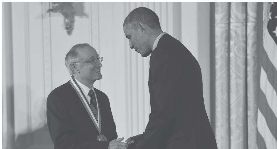
Figure 3. Receiving the National Medal of Science from President Barack Obama, November 20, 2014

and leadership.” While economists and psychologists had occasionally won the award, no political scientist had ever joined the ranks of the physical and biological scientists who have been the most frequent winners. For me, the most exciting part was going to the White House to be congratulated by President Barack Obama. As he placed the ribbon and medal around my neck, he whispered into my ear, “I’m proud of you.” It was one of the high points of my life. It brought back the happy memory of my being congratulated for being a “promising young scientist” fifty years earlier by another hero of mine, President Kennedy.