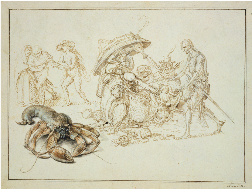
Fig. 2, Jacques de Gheyn II, Study of Hermit Crab and Witchcraft

as creatures of putrefaction. In describing “monstrous generations” not produced “according to the Laws of Nature,” Agrippa includes in this category the usual suspects (gnats generated from worms, wasps from a horse, bees from an ox), and “a Crab” whose “legs being taken off[f], and . . . buried in the ground” will later (presumably) emerge as “a Scorpion.” 34 De Gheyn’s creatures in this sketch, similarly, are both “zoomorphic” and markedly arthropod-like. Arthropods include crustaceans (such as shrimp, lobster, and crabs) and chelicerata (such as spiders and scorpions, along with insects). These animals have in common an exoskeleton, jointed appendages, and a segmented body. Behind and to the right of the accurately rendered hermit crab, a group of creatures troubles species identities. One clearly sports an exoskeleton, a kind of shell, on which, strangely, a naked human form clings like a barnacle. The short, broad cockroach-like being in the middle of the demonic group exhibits qualities of humans and arthropods, as do the two beings with long, segmented proboscis. In another version of hybridity, the segmented bodies of arthropods are mimicked in the humanoid form of the skeletal man on the right of the drawing.