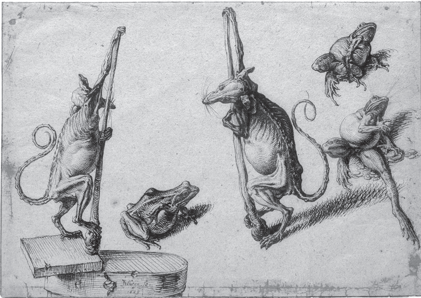
Fig. 4. Jacques de Gheyn II, Study of Two Rats and Three Frogs

This sense of ambiguous agency marks de Gheyn’s Study of Two Rats and Three Frogs (1609) as well (fig. 4). The strangely humanoid flayed rats and three frogs grasp sticks in ways that simultaneously suggest both aspiring ro-