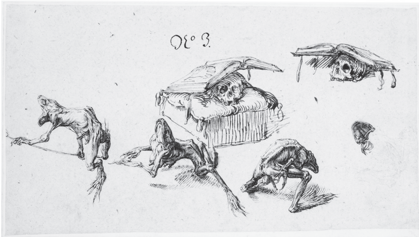
Fig. 3. Jacques de Gheyn II, Witches and Frogs

In a related sketch, Witches and Frogs (fig. 3), de Gheyn interrogates the problem of generation. Three amphibious chimera—frogs endowed with marked secondary sexual characteristics—surround a book of spells. In this instance, creatures that ambiguously might reproduce "outside" the laws of Nature through spontaneous generation have anthropomorphized female breasts and oversized male genitalia, as though they were reproducing monstrously through sexual intercourse.