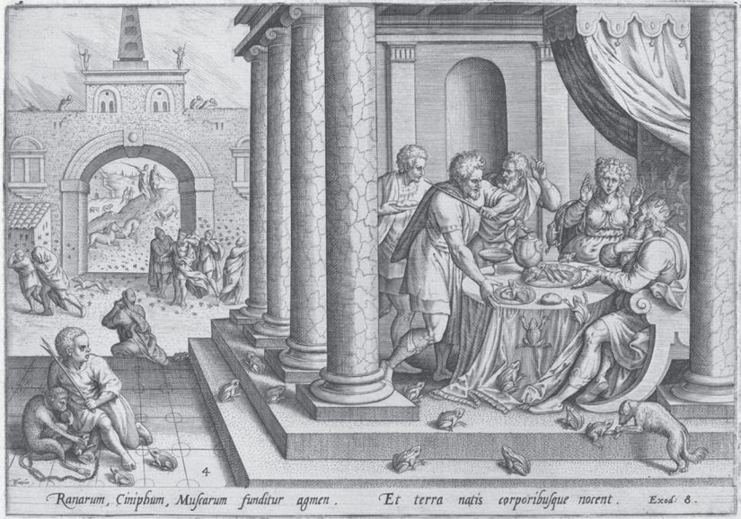
Fig. 6. Jan Sadeler, The Plague of Frogs (1585)

place in an already corrupted natural world. Biblical vermin provided writers and their readers ample precedent for interpreting “the corruption of nature” in simultaneously theological and material terms.