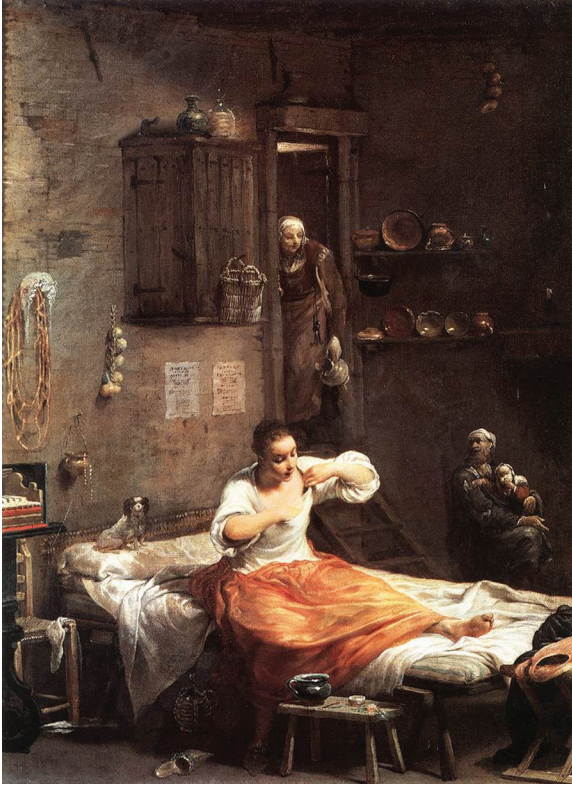
Fig. 1. Giuseppe Maria Crespi, Searcher for Fleas

is the presence of the dog on the bed. By the time Crespi painted, theories of spontaneous generation used to explain the rapid proliferation of insects had largely been replaced—thanks to Van Helmont, Harvey, Redi, and others—by notions of biogenesis, or reproduction from eggs. Although Robert Hooke was uncertain about the process of spontaneous generation, later microscopy placed domestic animals unambiguously in the chain of relations that lead to infestations: