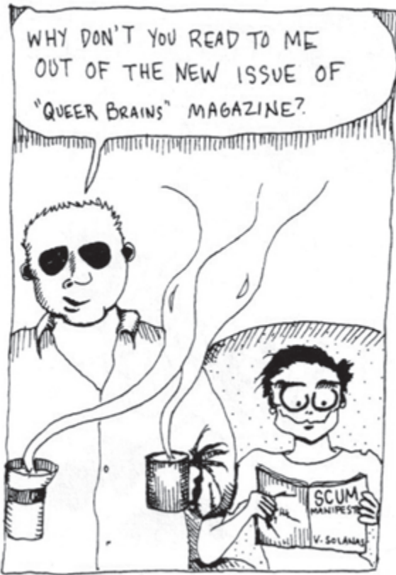
Hothead Paisan reading to her friend Roz from Valerie Solanas's SCUM Manifesto.

fully castrating offending members of the opposite sex. 14 Hothead's pals try to keep her from going over the edge, but their efforts are futile. Chicken the Cat practices yoga, deep meditation, and other healing rituals. She has been known to hide Hothead's coffee, to turn off the television before she blitzes out, and to hightail it before things really get out of hand. Roz is a recovering hothead, a former radical lesbian separatist, whose physical blindness serves as a metaphor for the emotional blindness caused by the unchecked rage of her youth. 15 She tries unsuccessfully to persuade Hothead that change is best achieved through nonviolent resistance and a commitment to institutional and social reform, not by trying to resurrect the matriarchy through a program of male genocide. Roz's liberal humanism stands in stark contrast to Hothead's militant feminism, and the zine offers a nuanced deliberation on the ethical and philosophical differences between these modes of politi-