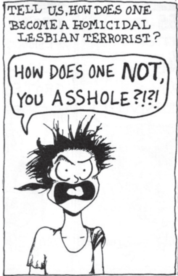
Hothead Paisan: Homicidal Lesbian Terrorist.

projection that she must eliminate not only “the machine” but “the man” as well, Hothead ventures maniacally into the world hell-bent on vengeance, packing a small arsenal and an enormously overinflated ego. Like the Incredible Hulk, her actions are swift, her decisions are final, and her judgment is impaired by a rage of epic proportions.