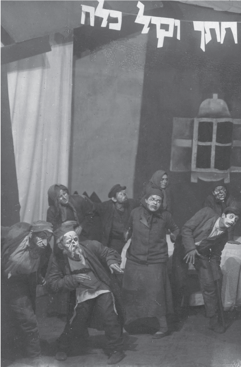
Fig. 4. Act 2 beggars' dance. Habima's The Dybbuk . Directed by Evgeny Vakhtangov. Premiere: January 31, 1922.