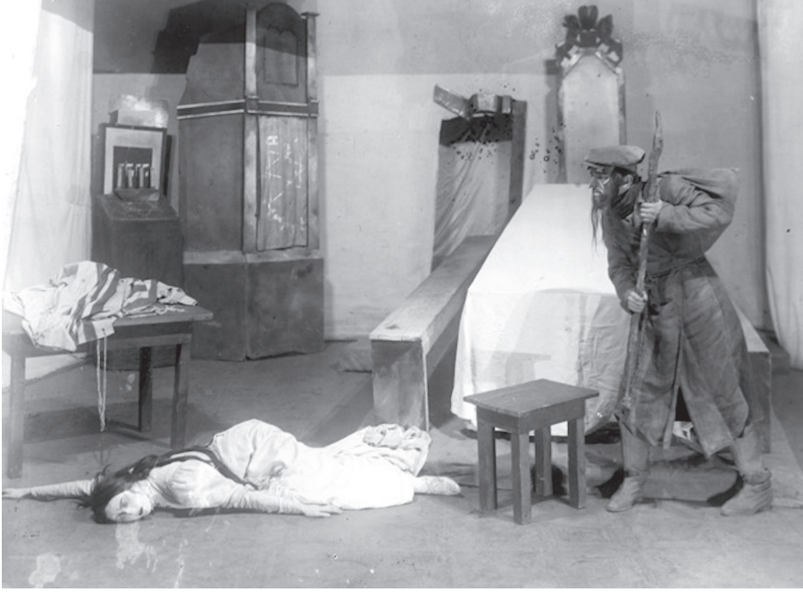
Fig. 5. Finale of act 3. Habima's The Dybbuk . Directed by Evgeny Vakhtangov. Premiere: January 31, 1922.