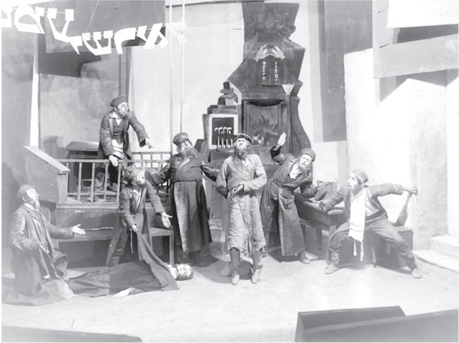
Fig. 3. Finale of act 1. Habima's The Dybbuk . Directed by Evgeny Vakhtangov. Premiere: January 31, 1922.