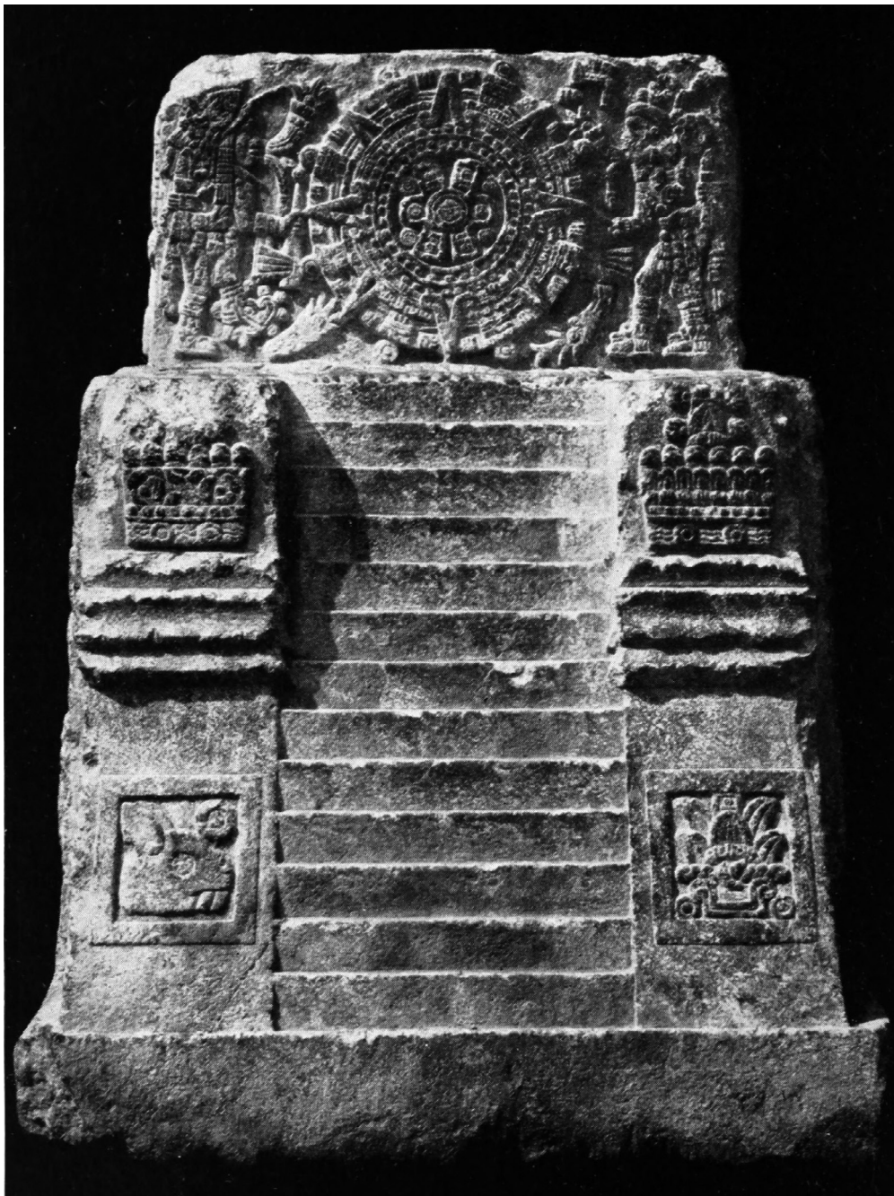
Figure 6.6. Teocalli of the Sacred Warfare. Spinden 1928.

Finally, another important feature in the sun god altar on page 71 of the Codex Borgia indicates not only the completion of a calendar cycle but also a more specific ceremonial event. I believe that the colorful banners raised behind the god should be taken as a reference to Panquetzaliztli , a ceremony dedicated to the sun. As discussed at length in the preceding chapters, Panquetzaliztli was the most appropriate time to perform the ritual of the New Fire, as it fell between the time of the sun's nadir and winter solstice.