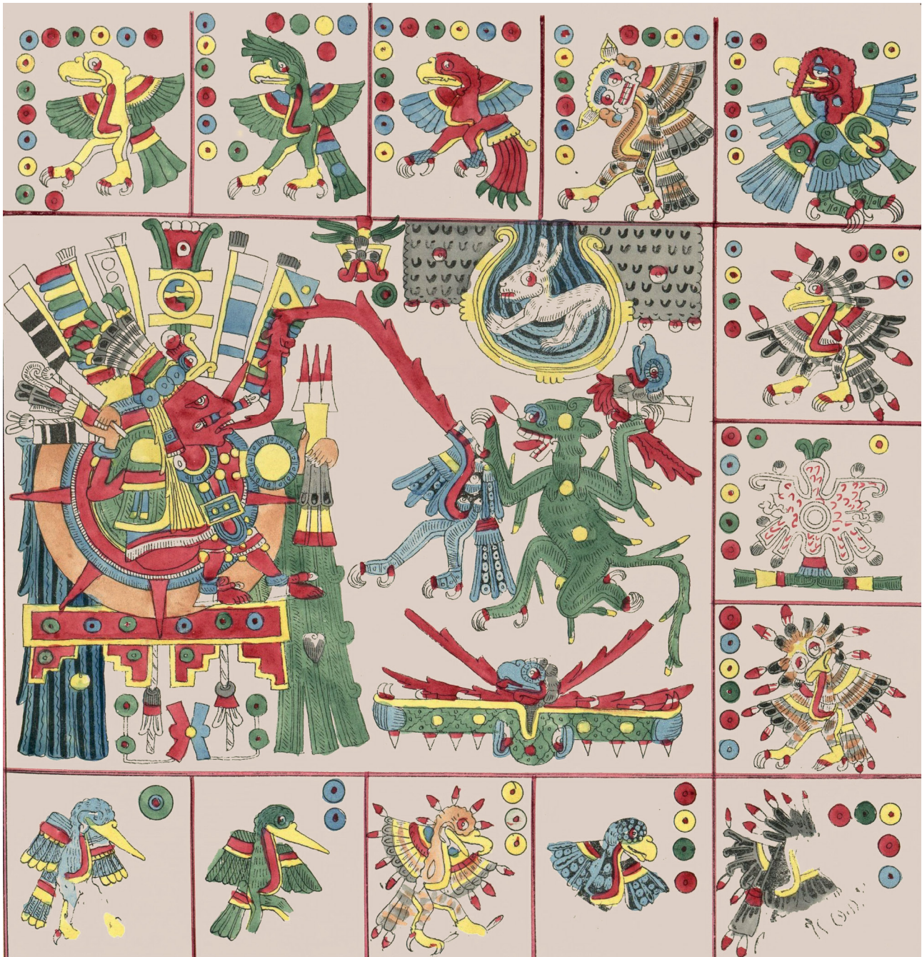
Figure 6.5. The sun god and the thirteen birds of the trecenas. Codex Borgia, p. 91. Kingsborough 1831.

“leaf” and “year” are homophonous in Nahuatl. Therefore, the symbol combines Mixtec calendrical conventions with Nahuatl terminology—another indication that the Codex Borgia hails from the southern Puebla region, where the two ethnic and linguistic groups closely interacted.