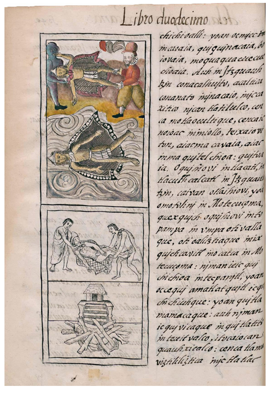
Figure 8.10. The death of Motecuhzoma and Itzquauhtzin and the burial of Motecuhzoma, Historia general de las cosas de Nueva España . Florence, Biblioteca Medicea Laurenziana, Ms. Med. Palat. 220, vol. 3, bk. 12, f. 40v. Courtesy of MiC. Any further reproduction is prohibited.

the deceased rulers rely on Mesoamerican canons in the representation of sacrificial victims, while the transportation of Motecuhzoma's body is based on the Catholic theme of the burial of Christ in the following scene. I agree with the latter identification, which is amply evidenced by the many representations of the same theme in Mexican conventos (Fig. 8.11). However, I do not think that the colored and frontal depiction of the Indigenous leaders is related to the depiction of human sacrifice in