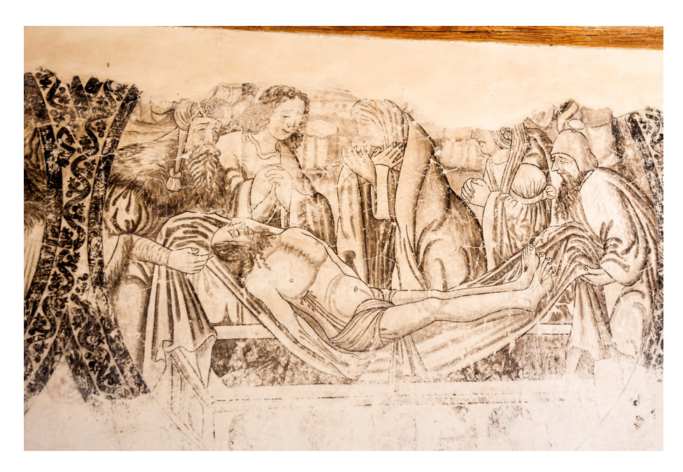
Figure 8.11. The burial of Christ, sixteenth century. Cloister, Convento de Santo Domingo, Tepetlaoxtoc, state of Mexico.

which were front-facing, hieratic, and flat, as seen in the famous feather mosaic that Diego Huaniztin, the governor of Mexico City, bequeathed to Pope Paul III in 1539 (Fig. 8.12). The sequence of images in the Florentine Codex presents the trajectory from iconicity to naturalism.