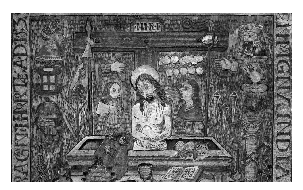
Figure 8.12. Diego Huanitzin, Mass of Saint Gregory, detail. Musée des Jacobins, Auch.

The use of monochrome enabled Indigenous artists to discuss the new status and function of the image in a colonial context in purely visual terms. The humanization of God according to Christian canons denotes a world without gods. The new god imposed by the Spaniards after barbaric campaigns of destruction that razed ancient