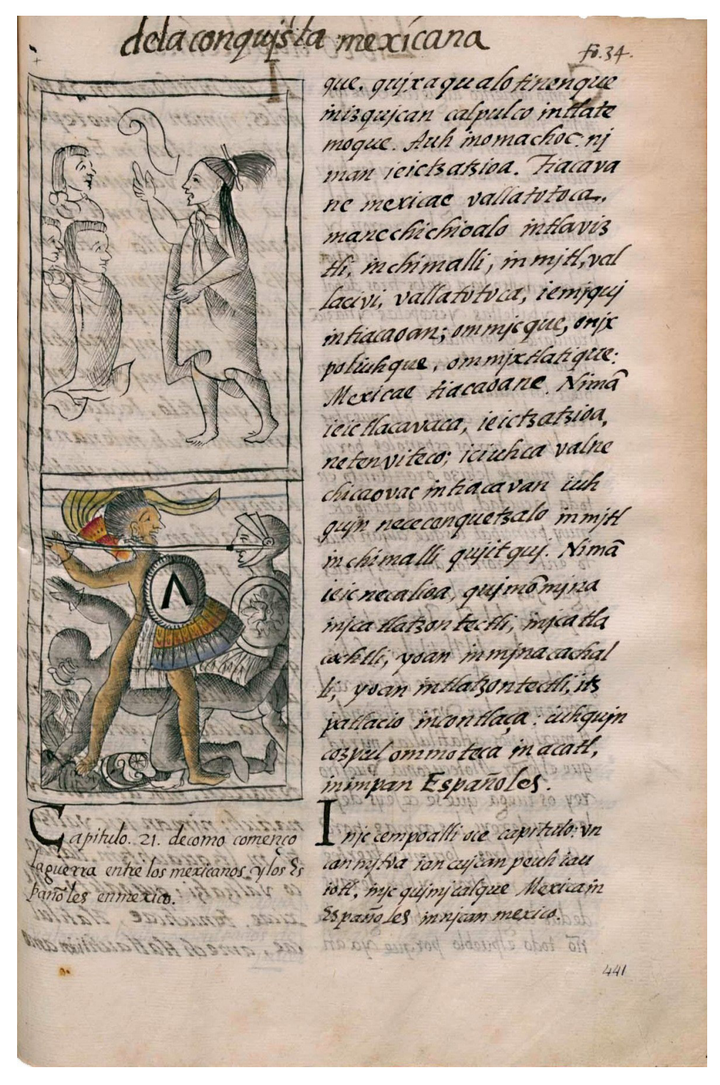
Figure 8.9. Tlatelolca insurgent warrior, Historia general de las cosas de Nueva España . Florence, Biblioteca Medicea Laurenziana, Ms. Med. Palat. 220, vol. 3, bk. 12, f. 34r. Courtesy of MiC. Any further reproduction is prohibited.

the lower half of the image, in which the murky waters of the canal and the body of the Mexica tlatoani are depicted in gray. The use of color progressively ceases and in the second vignette the image is rendered only in black outline. This shift in the use of color is accompanied by changes in composition. While the bodies of the deceased rulers are depicted in a frontal position in the upper part of the image and the point of view is longitudinally placed in the air, Motecuhzoma's body is disarticulated when Nahua priests transport it. The viewer finds themself on