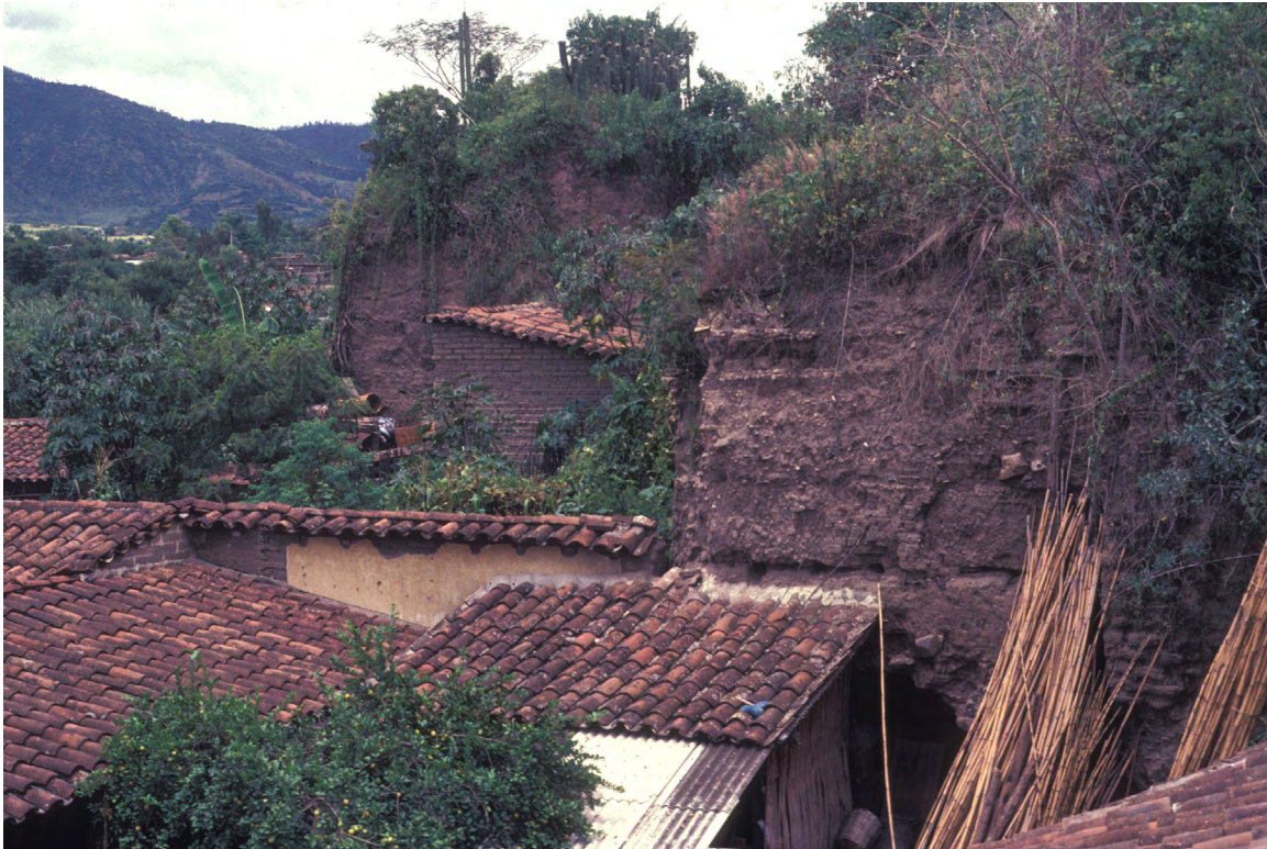
Figure 2.3. Prehispanic mounds with multiple visible plaster floors in a house lot in the center of Ejutla de Crespo.