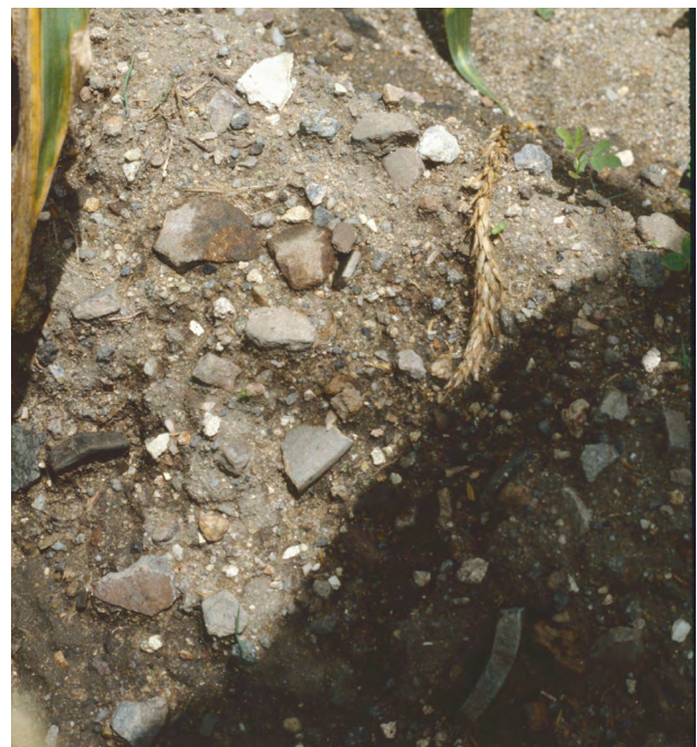
Figure 2.6. Fragments of shell and prehispanic pottery visible on the surface of a field at the eastern edge of Ejutla de Crespo.

Broken prehispanic pottery littered the area, with diagnostic sherds from Monte Albán Late I through Monte Albán V, but most abundant were the ubiquitous, undecorated G-35 bowls that date broadly to the Classic period (Feinman and Nicholas 2013, appendix IV). Ten of 11 figurine fragments, as well as the one spindle whorl and the two pottery wasters that we collected during the regional survey, were found in these fields. Based on these surface artifacts, it is likely that spinning and ceramic production were also practiced in this sector of the site.