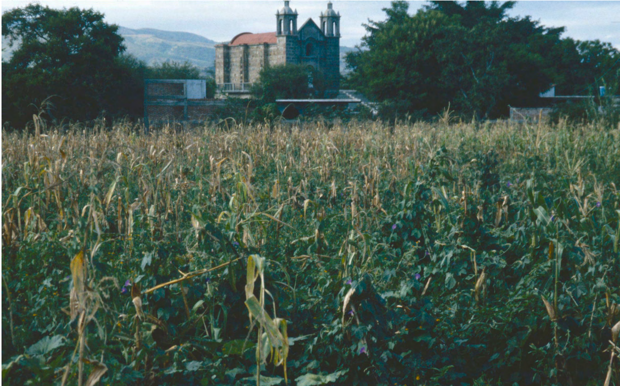
Figure 2.5. El Calvario on the top of a prehispanic mound just south of the area of dense surface shell.

Morris 1966). The most common of these, almost 60%, was mother of pearl, Pinctada . All these species were used in Mesoamerica as raw materials for shell ornaments and ritual items (e.g., Ekholm 1961; Kolb 1987; Pires-Ferreira 1975; Starbuck 1975; Suárez 1977), and several of these species were recovered from Early Formative contexts in the Valley of Oaxaca (Flannery and Marcus 2005, 81; Pires-Ferreira 1975, 1976).