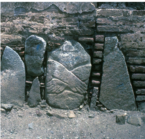
Figure 2.4. Carved stone with crossed arms (placed upside down) in the wall foundation of a house lot in Ejutla de Crespo.

The site's monumental core consists of a large, raised platform adjacent to a linear group of large mounds (see Figure 2.2). Two smaller structures are situated on top of the platform, one at each end; the center of the platform may have served as a fairly open plaza. The two tallest structures are part of the linear group of four mounds on the north side of the platform; three of the mounds partially enclose a plaza, open on the north, with the