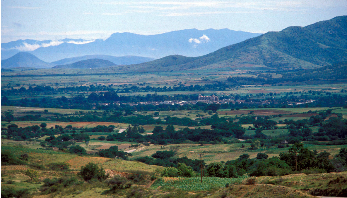
Figure 2.1. View of Ejutla de Crespo in the center of the Ejutla Valley (photograph taken in 1985 during the regional survey).